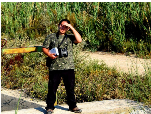
Our local expert