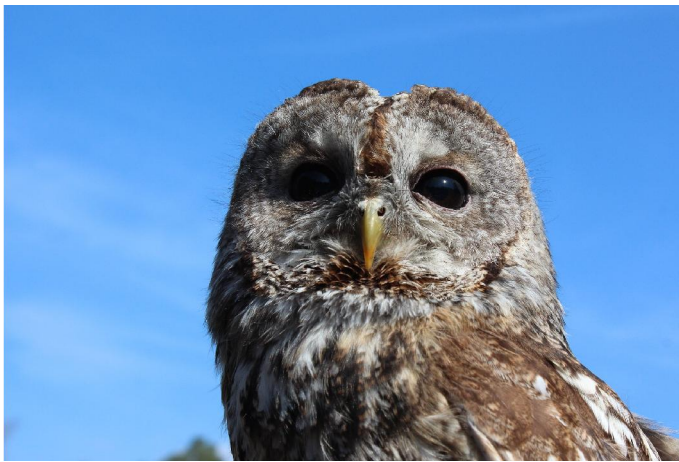
A tawny owl