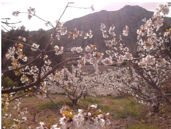
Cherry trees blossoming